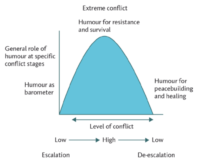
Figure 2. Stages of conflict and humour

The next figure shows the particular roles of humour at different stages of the conflict.